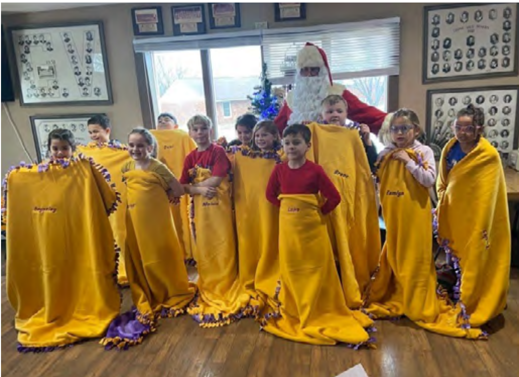
Cedar Vale Lions treated the second graders to a pre-Christmas lunch with a special guest. Each of the students received a personalized blanket.