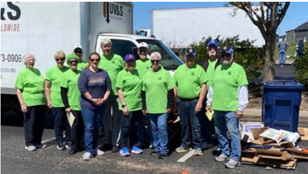
Bel Aire Lions serviced 300 cars with shredding and electronics recycling at a recent event in their community. A total of 8,900 pounds of shredded document weight. That equates to 75.6 trees saved by recycling paper.