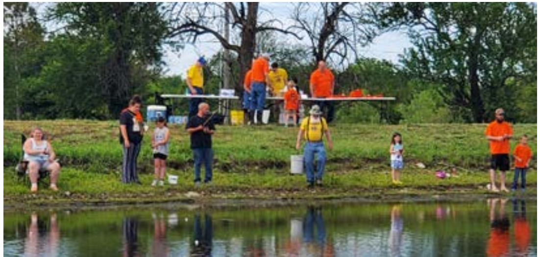
The 53 participants in the Humboldt Lions Club Annual Fishing Derby enjoyed a sunny Saturday morning of fishing on the Humboldt Golf Course pond.