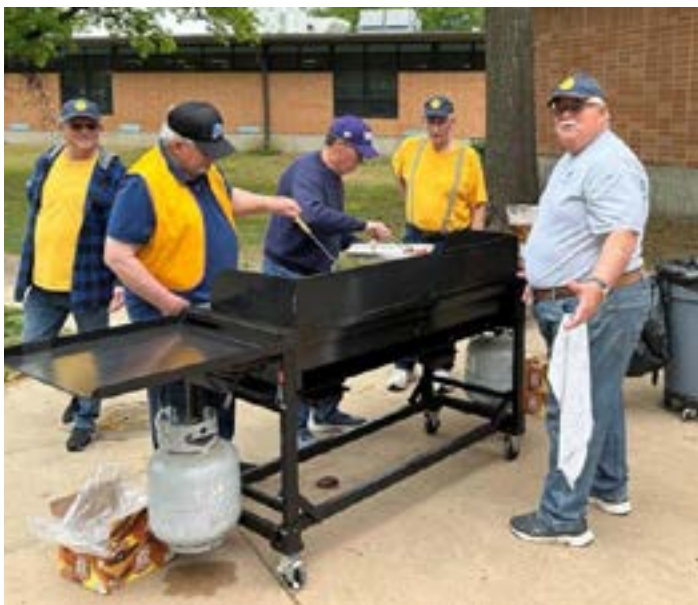
Clearwater Lions cooked and served for about 120 students and staff at the Clearwater Intermediate School Spring Fling.