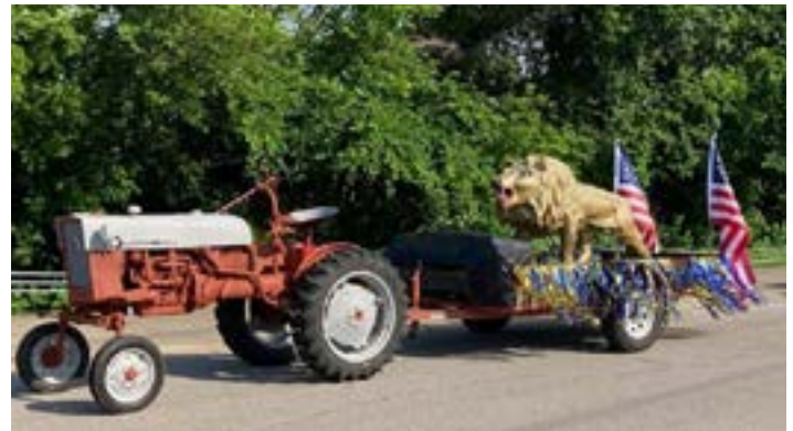
Parsons Lions participated in the Parsons Memorial Day parade with a Lion float pulled by a vintage tractor