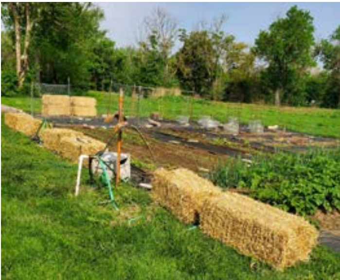
Colwich Lions Club community garden will soon have produce available to the community.