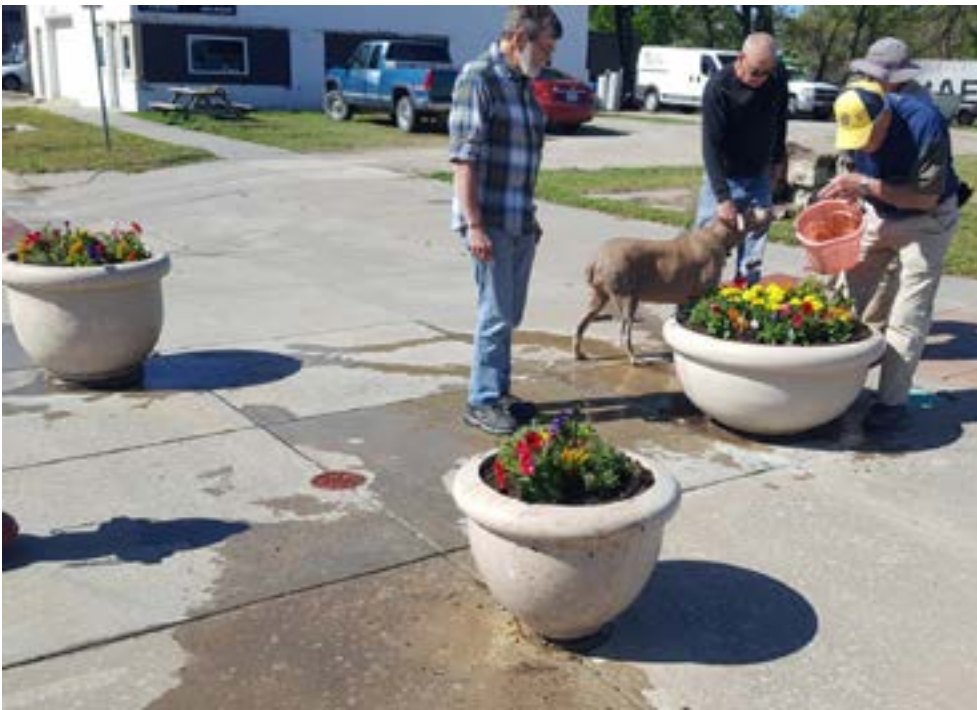
Augusta Lions Club participates in the Downtown Augusta Adopt-A-Pot project, filling pots at State Street and 4th Ave.