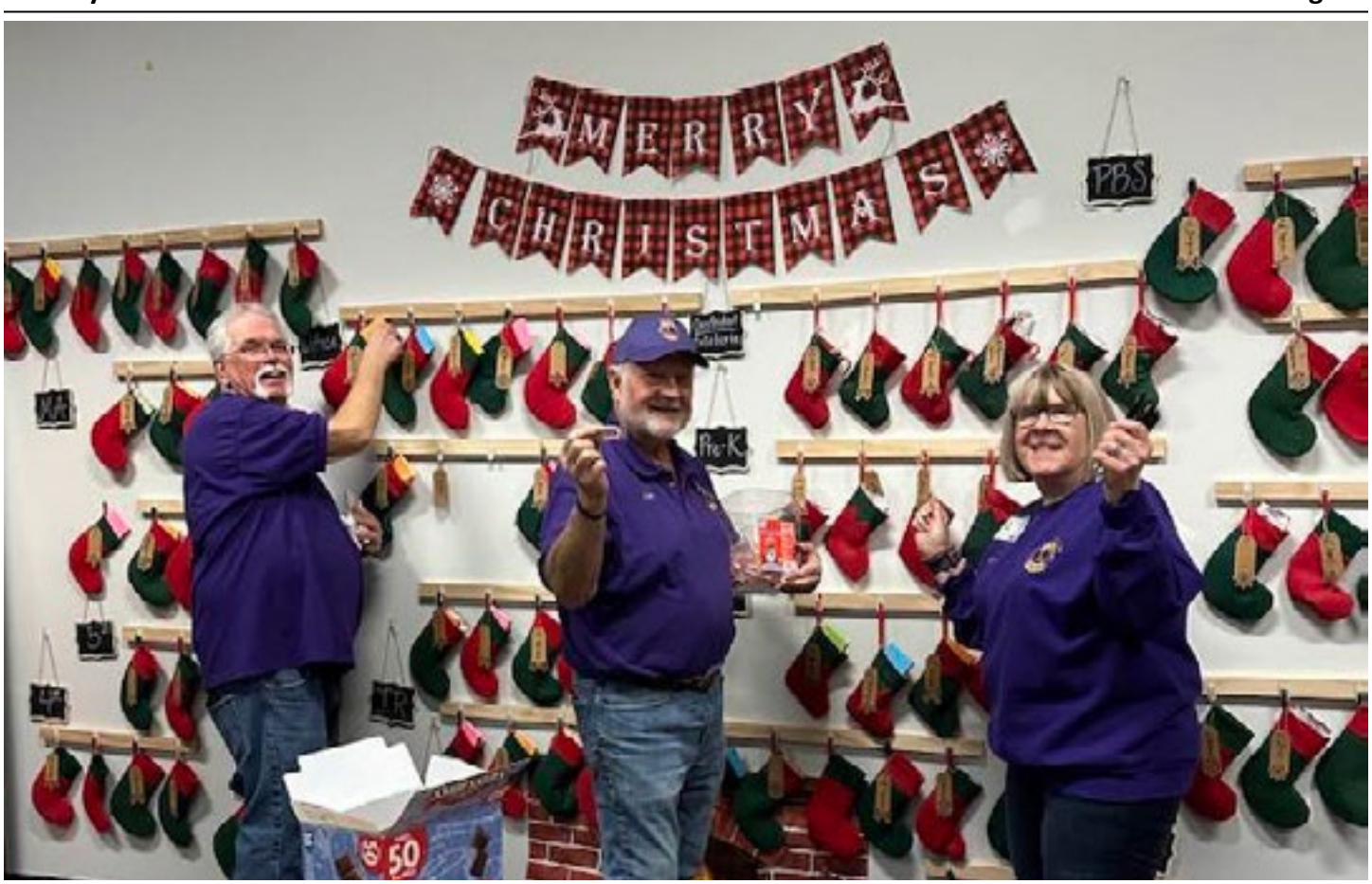
Bel Aire Lions stuffing 125 stockings with goodie's for teachers and staff of Isely Elementary.