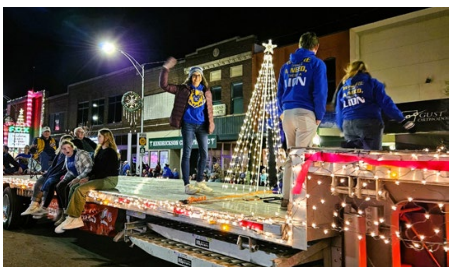
Newton Lions organize the Christmas Parade of Lights to start the holiday season in their community.