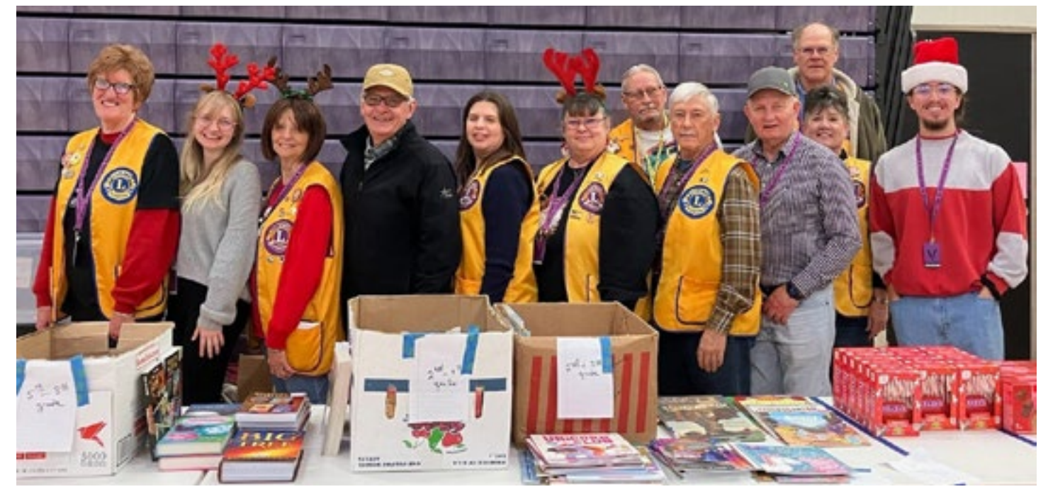
Valley Center Lions helped a local non-profit, From The Ground Up, with Christmas for the local kids. Lions helped sort candy for stockings, organized gifts, helped with distribution day and more.