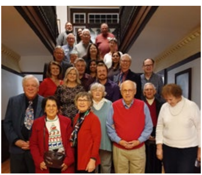
Emporia Lions shared stories of their holiday Random Acts of Kindness at a Christmas Party at the historic Gufler Mansion