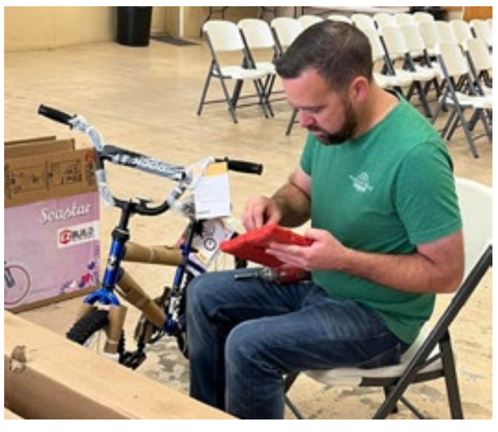
Wellington Lions' Operation Holiday provided gifts for 235 children in 97 families in their community.