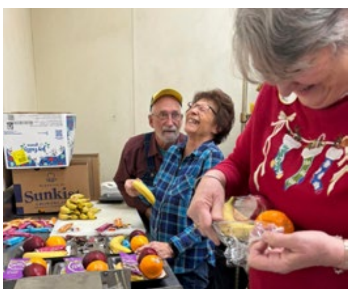
Lyndon Lions share some fun assembling 200+ fruit baskets for seniors in the Lyndon and Vassar communities.

The club held a tree lighting in early December, serving hot cocoa and cookies to a nice turnout.