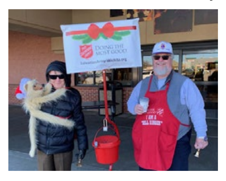
Wichita Downtown Lions ringing bells for the Salvation Army

Christmas parades, parties and programs to spread the holiday spirit in their communities were activities that Lions from across the district were involved in this season. Here's just a sampling of the many events