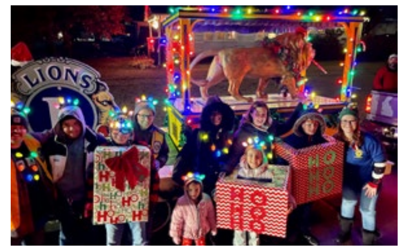
Goddard Lions made participation in the Christmas parade a family affair with member's children joining the fun as gifts walking alongside the Lions' float.