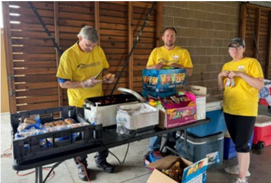
Goddard Lions served hot dogs and worked on various projects during Neighbors United, a community-wide day of service. Projects ranged from planting flowers, cleaning buses, yard clean-up, building beds in the community garden and many more. Approximately 150 volunteers came together for a morning of volunteering in the community.